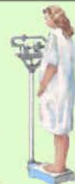
Sudden Weight Gain