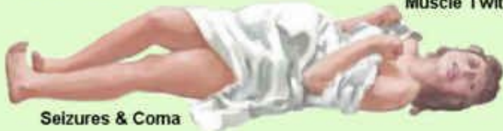
Seizures & Coma