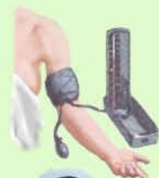
Rising High Blood Pressure Above Normal