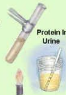
Protein In Urine