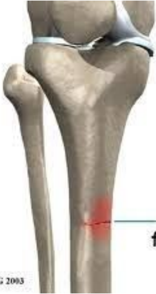
Tibial stress fracture