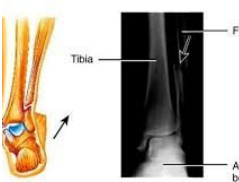
(e) Pott's fracture