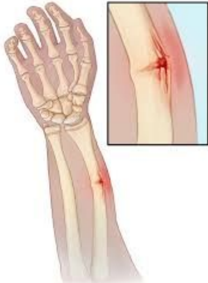
FIGURE 10-10 FRACTURE OF THE RADIUS AND ULNA OF THE FOREARM